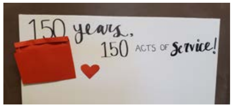
The Wadsworth Young Women are doing 150 Acts of Service to celebrate 150 years of the Young Women's organization