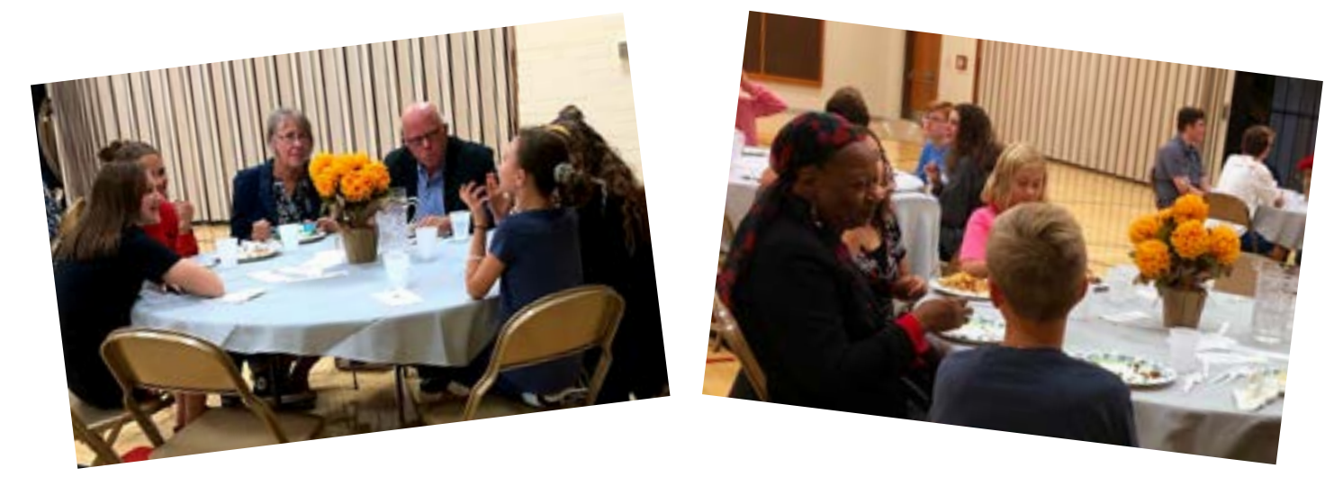
Akron Youth planned a dinner and invited different members of the ward they wanted to get to know better. This is a great way to increase fellowship and unity within the ward as well as give opportunities to learn the talents of ward members. Older members can help assist and mentor the youth working on their goals in the new youth personal development program.