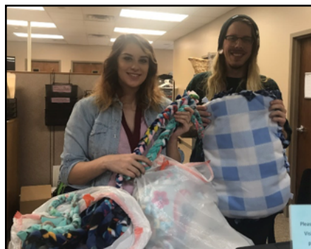
Summit County Humane Society