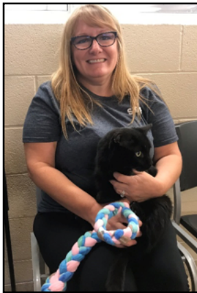
Medina County Humane Society

Last year we asked the cub scouts and activity day girls from each ward and branch to make pet toys and pet beds out of fleece for donation to animal shelters. Everyone completed their projects and they were delivered to the humane societies for each of the counties in our stake. (We are still working on getting them to Ashland.) Each delivery was met with a warm thank you. Little octopus dolls were also made for patients at Children’s Hospital. Thanks to the leaders and children for participating.