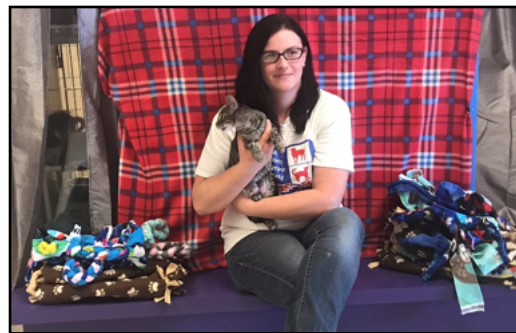
Stark County Humane Society