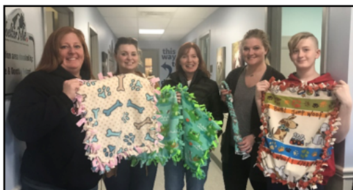
Tuscarawas County Humane Society