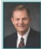
Elder Gary L. Stevenson Quorum of the Twelve Apostles