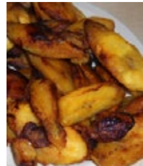
Jollof Rice, Bean Cakes, and fried Plantain