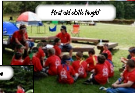
First aid skills taught

deacon-age Boy Scouts as Patrol Leaders.