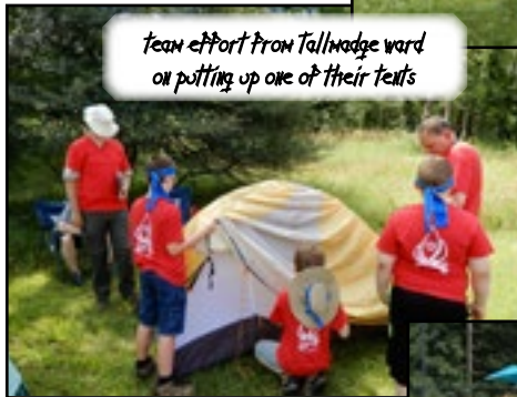
Team effort from Tallwedge ward on putting up one of their tents