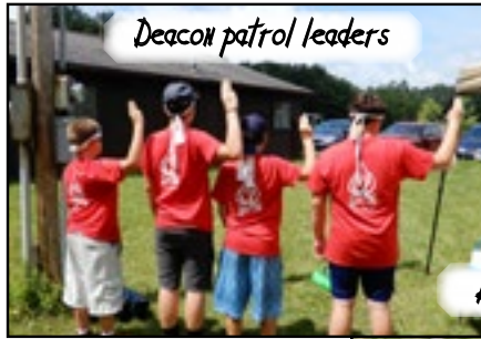
Deacon patrol leaders

deacon-age Boy Scouts as Patrol Leaders.