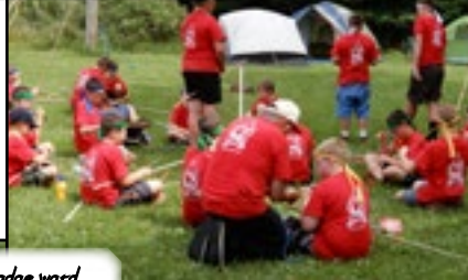
knots and lashing instruction

These deacons taught skills in lashing and knots, first aid, and compass