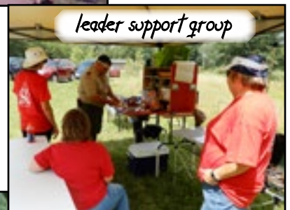
leader support group