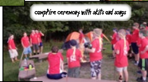
campfire ceremony with skits and songs

ceremonies. Thursday night skits and camp songs ended